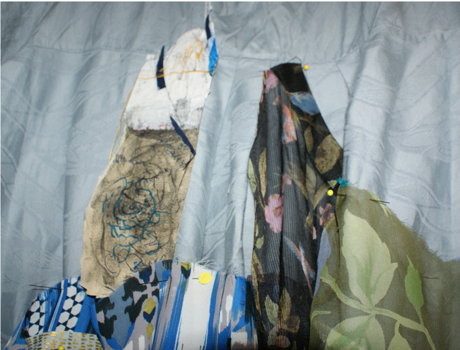
Figure 7 Art on art. Susan Osman.

One respondent brought other people into what I'd imagined as a one-on-one exchange. In one of the most arresting images I received was from a mother and grandmother and nurse. She pictured her collage in the center of a table with the hands of her husband, children and grandchildren circled around it. The hands of two adults and one child are photographs pasted on top of the photograph to make the family circle whole. They lived a different state and could not be visited during pandemic times. We thus view both the whole family circle and its absence during that long stay at home period.