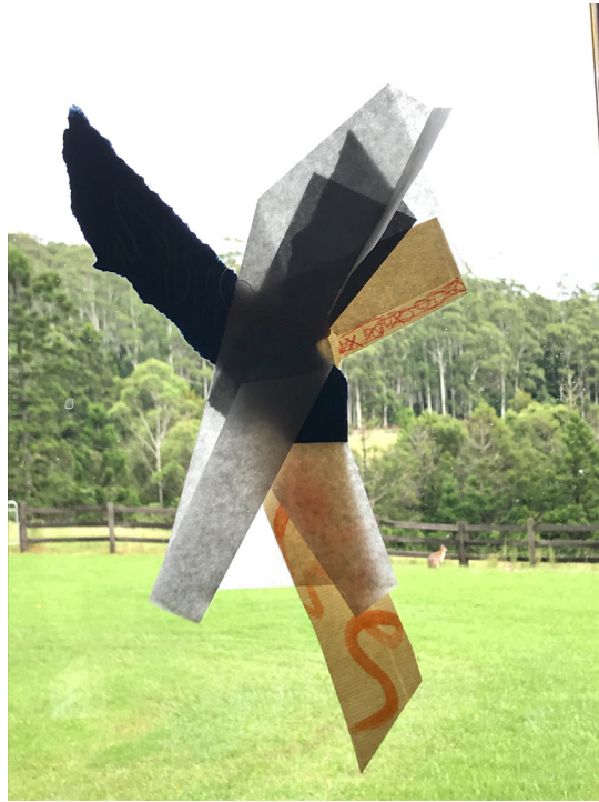
Figure 6 an Invitation looking out the window. Susan Osman.

array of scarves to frame view of a view of a Chicago backyard, a kind of larger collage that suggested life and happiness within and dimness without. Another forms an “x” across a windowpane looking out to a picture-perfect green hill of an Australian farm, as though to mark the world beyond the home as a no-go zone.