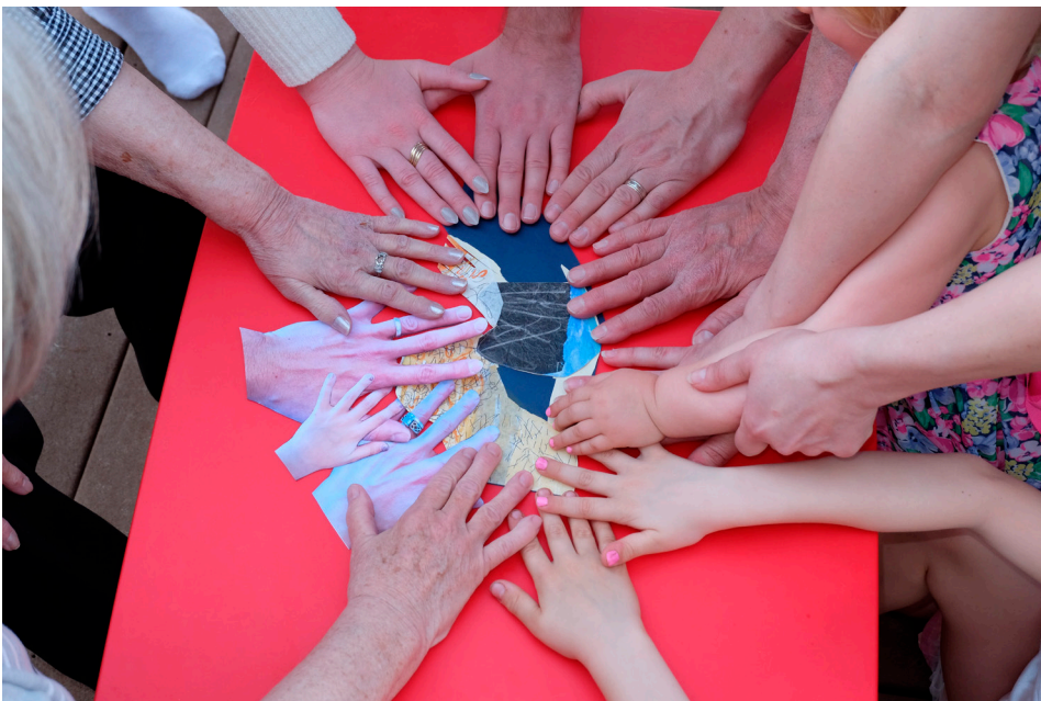
Figure 8 The family circle. Susan Osman.

One respondent brought other people into what I'd imagined as a one-on-one exchange. In one of the most arresting images I received was from a mother and grandmother and nurse. She pictured her collage in the center of a table with the hands of her husband, children and grandchildren circled around it. The hands of two adults and one child are photographs pasted on top of the photograph to make the family circle whole. They lived a different state and could not be visited during pandemic times. We thus view both the whole family circle and its absence during that long stay at home period.