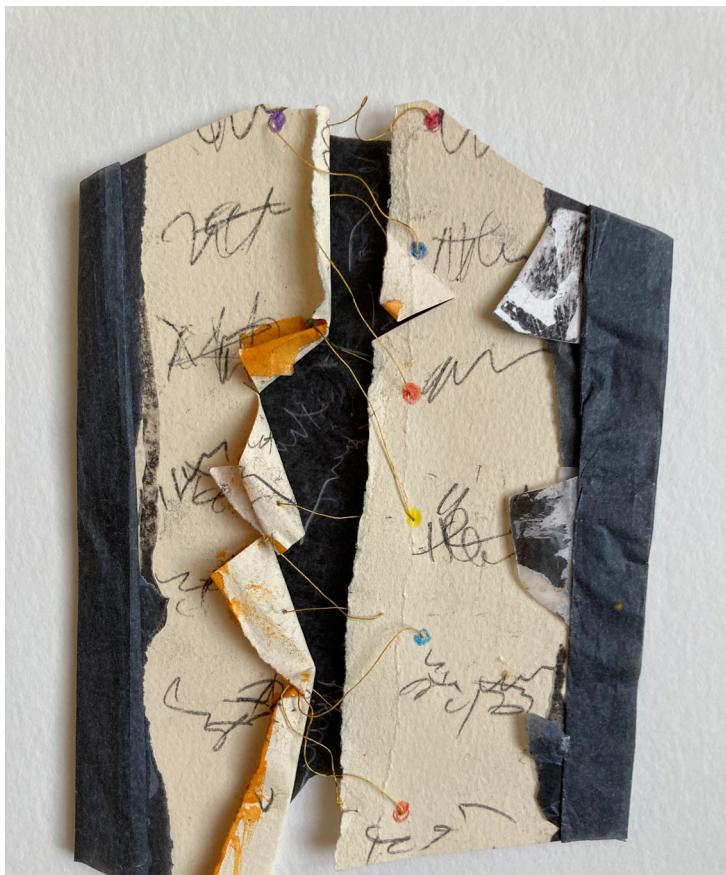
Figure 4 an Invitation. Susan Osman.

The Invitation in figure 5 is an example of how some of the pieces were not just palpable but could also be considered drawing implements. Carbon paper is the main support, which was guaranteed to smudge the hands of its recipient. Small bits of white paper marked with my fingerprints demonstrate how my hands were also marked as I composed the collage, creating a distanced and time-lapsed similitude between me and the other person.